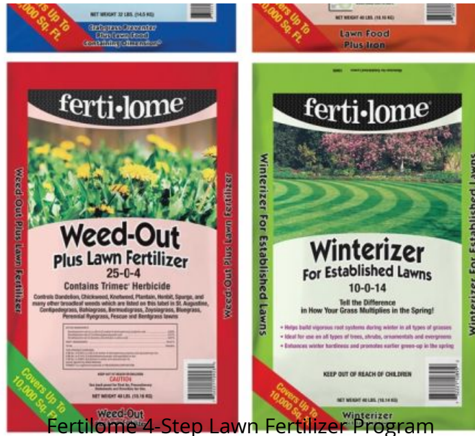
Fertilome 4-Step Lawn Fertilizer Program